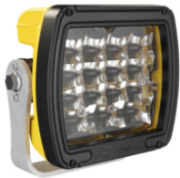
Part Number 1300571 24V LED Work Light with Yellow Housing, Polycarbonate Lens & Dual White Anti-Glare Pattern