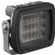
Part Number 1300601 24V Anti-Glare Beam Pattern w/ Polycarbonate Lens