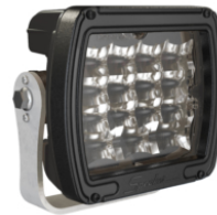
Part Number 1300641 24V LED Work Light with Black Housing, Polycarbonate Lens & Dual White Anti-Glare Pattern