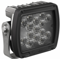
Part Number 1300581 24V LED Work Light with Black Housing, Polycarbonate Lens & Flood Beam Pattern