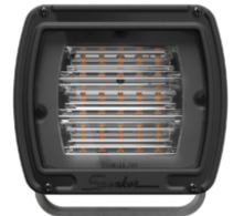
Part Number 1300821 12-24V LED Anti-Glare, Eco-Friendly Work Light with Black Housing