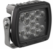
Part Number 1300711 24V LED Work Light with Black Housing, Polycarbonate Lens & Spot Beam Pattern