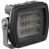
Part Number 1300741 12V LED Work Light with Black Housing, Polycarbonate Lens & Anti-Glare Pattern