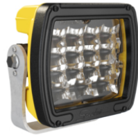
Part Number 1300751 12V LED Work Light with Yellow Housing, Polycarbonate Lens & Dual White Anti-Glare Pattern