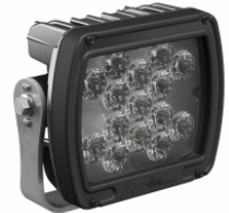
Part Number 1300711 24V LED Work Light with Black Housing, Polycarbonate Lens & Spot Beam Pattern