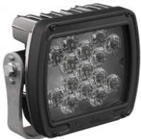
Part Number 1300721 12V LED Work Light with Black Housing, Polycarbonate Lens & Flood Beam Pattern