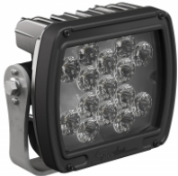
Part Number 1300581 24V LED Work Light with Black Housing, Polycarbonate Lens & Flood Beam Pattern