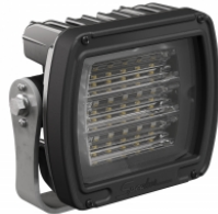
Part Number 1300601 24V Anti-Glare Beam Pattern w/ Polycarbonate Lens