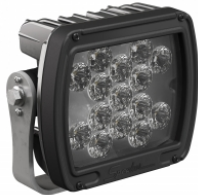
Part Number 1300591 24V LED Work Light with Black Housing, Polycarbonate Lens & Trapezoid Beam Pattern