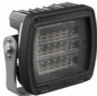
Part Number 1300741 12V LED Work Light with Black Housing, Polycarbonate Lens & Anti-Glare Pattern