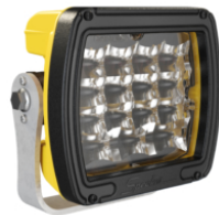
Part Number 1300751 12V LED Work Light with Yellow Housing, Polycarbonate Lens & Dual White Anti-Glare Pattern