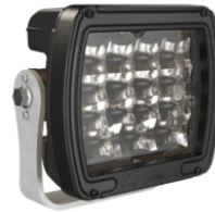
Part Number 1300641 24V LED Work Light with Black Housing, Polycarbonate Lens & Dual White Anti-Glare Pattern