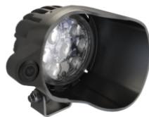
Part Number 0559913

12-24V LED Work Light with Flood Pattern & Panel Mount