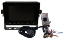
Part Number 6600801 COLOR MONITOR, 5", M12