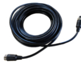
Part Number 3271581 4 PIN M12 CABLE, 6 m