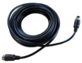
Part Number 3271561 4 PIN M12 CABLE, 10 m