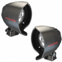
Part Number 0551753 12-24V LED Work Light with Spot Pattern & Side View Mirror Mount - 2 Light Kit