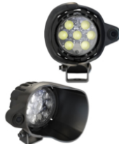
Part Number 0559913 12-24V LED Work Light with Spot Pattern & Side View Mirror Mount with Camera - 2 Light Kit