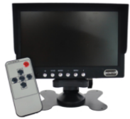
Part Number 6600841 7" Split Screen Monitor