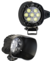
Part Number 0559913 12-24V LED Work Light with Spot Pattern & Side View Mirror Mount with Camera - 2 Light Kit