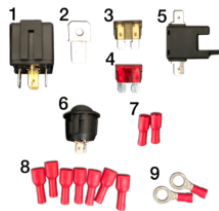
Part Number 8200081 Relay/Switch Kit