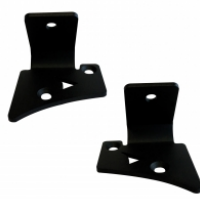
Part Number 6149233 A-Pillar Mounting Kit for Jeep TJ