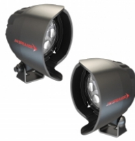
Part Number 0551753 12-24V LED Work Light with Spot Pattern & Side View Mirror Mount - 2 Light Kit