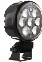
Part Number 0555411 12-24V LED Work Light with Flood Pattern & Harness