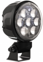
Part Number 0549841 12-24V LED Work Light with Trapezoid Pattern