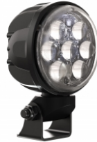
Part Number 0551001 12-24V LED Work Light with Spot Pattern