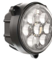
Part Number 0555461

12-24V LED Work Light with Spot Pattern & Side View Mirror Mount - 2 Light Kit