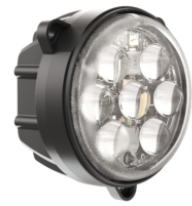
Part Number 0555461 12-24V LED Work Light with Flood Pattern & Panel Mount