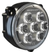
Part Number 0560341 12-24V LED Work Light with Flood Pattern & Panel Mount