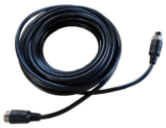
Part Number 3271561 4 PIN M12 CABLE, 10 m