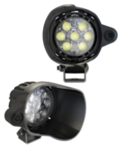
Part Number 0559913 12-24V LED Work Light with Spot Pattern & Side View Mirror Mount with Camera - 2 Light Kit