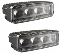
Part Number 1603603 12V DOT/ECE LED Fog Light - 2 Light Kit