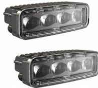
Part Number 1603603 12V DOT/ECE LED Fog Light - 2 Light Kit