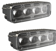
Part Number 1603603 12V DOT/ECE LED Fog Light - 2 Light Kit