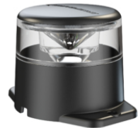
Part Number 0646481 12-80V White Class III LED Strobe Light with Flange Mount