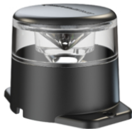
Part Number 0646451 12-80V Red Class III LED Strobe Light with Flange Mount