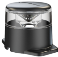
Part Number 0646451 12-80V Red Class III LED Strobe Light with Flange Mount