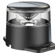
Part Number 0646471 12-80V Blue Class III LED Strobe Light with Flange Mount