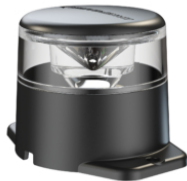
Part Number 0646461 12-80V Green Class III LED Strobe Light with Flange Mount