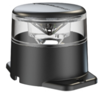
Part Number 0646481 12-80V White Class III LED Strobe Light with Flange Mount