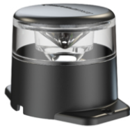
Part Number 0646461 12-80V Green Class III LED Strobe Light with Flange Mount