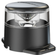
Part Number 0646441 12-80V Amber Class II LED Strobe Light with Flange Mount