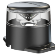
Part Number 0646471 12-80V Blue Class III LED Strobe Light with Flange Mount