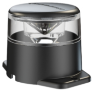
Part Number 0646441 12-80V Amber Class II LED Strobe Light with Flange Mount