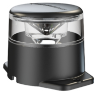
Part Number 0646461 12-80V Green Class III LED Strobe Light with Flange Mount