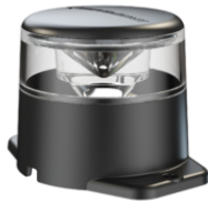
Part Number 0646471 12-80V Blue Class III LED Strobe Light with Flange Mount