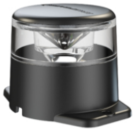
Part Number 0646441 12-80V Amber Class III LED Strobe Light with Flange Mount