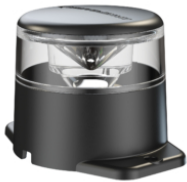
Part Number 0646441 12-80V Amber Class III LED Strobe Light with Flange Mount