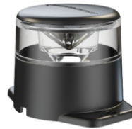
Part Number 0646481 12-80V White Class III LED Strobe Light with Flange Mount