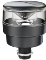
Part Number 0646411 12-80V Green Class III LED Strobe Light with Pipe Mount