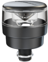
Part Number 0646411 12-80V Green Class III LED Strobe Light with Pipe Mount