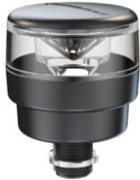
Part Number 0646401 12-80V Red Class III LED Strobe Light with Pipe Mount