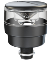
Part Number 0646431 12-80V White Class III LED Strobe Light with Pipe Mount