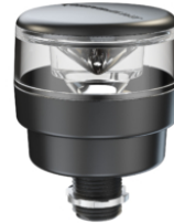
Part Number 0646431 12-80V White Class III LED Strobe Light with Pipe Mount