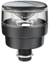
Part Number 0646391 12-80V Amber Class III LED Strobe Light with Pipe Mount