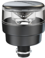
Part Number 0646421 12-80V Blue Class III LED Strobe Light with Pipe Mount