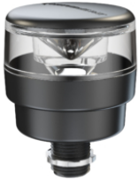
Part Number 0646391 12-80V Amber Class III LED Strobe Light with Pipe Mount