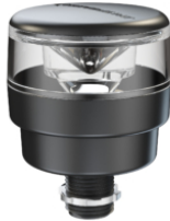
Part Number 0646401 12-80V Red Class III LED Strobe Light with Pipe Mount