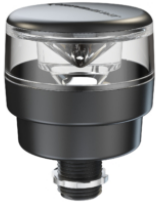
Part Number 0646401 12-80V Red Class III LED Strobe Light with Pipe Mount