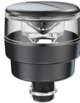
Part Number 0646421 12-80V Blue Class III LED Strobe Light with Pipe Mount