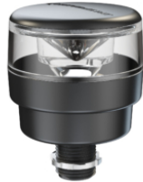
Part Number 0646421 12-80V Blue Class III LED Strobe Light with Pipe Mount