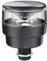
Part Number 0646411 12-80V Green Class III LED Strobe Light with Pipe Mount