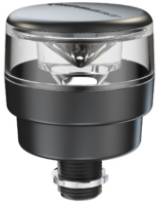
Part Number 0646401 12-80V Red Class III LED Strobe Light with Pipe Mount