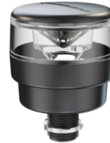
Part Number 0646431 12-80V White Class III LED Strobe Light with Pipe Mount