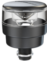
Part Number 0646411 12-80V Green Class III LED Strobe Light with Pipe Mount