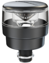
Part Number 0646421 12-80V Blue Class III LED Strobe Light with Pipe Mount