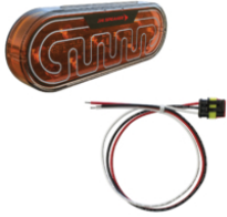
Part Number 0346784 12-24V DOT LED Heated Amber Front Position & Front Turn Signal Light with Harness