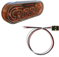
Part Number 0346784 12-24V DOT LED Heated Amber Front Position & Front Turn Signal Light with Harness