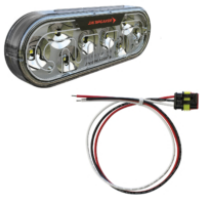
Part Number 0346724 12-24V DOT LED Heated White Reverse Light with Harness