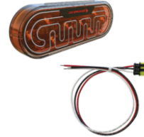
Part Number 0346714 12-24V DOT LED Heated Amber Rear Turn Light with Harness