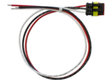
Part Number 3270501 3-Pin AMP Connector Wire Harness Assembly