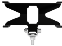
Part Number 8201051 Pedestal Mount for Model 260 ECE