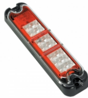
Part Number 0339011 48V LED Stop, Tail, Turn Signal & Backup Light without Flasher