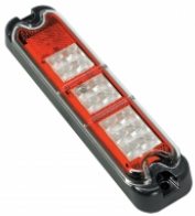
Part Number 0338061 12V LED Stop, Tail, Turn Signal & Backup Light without Flasher