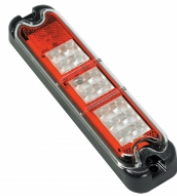
Part Number 0339021 48V LED Stop, Tail, Turn Signal & Backup Light Kit (2 Lights with 2 Amp Flasher)