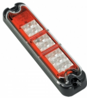
Part Number 0338091 24-36V LED Stop, Tail, Turn Signal & Backup Light without Flasher