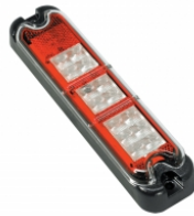
Part Number 0339021 48V LED Stop, Tail, Turn Signal & Backup Light Kit (2 Lights with 2 Amp Flasher)