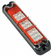
Part Number 0338091 24-36V LED Stop, Tail, Turn Signal & Backup Light without Flasher