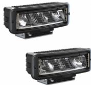
Part Number 0552243 12V DOT LED Heated Headlight - 2 Light Kit