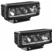
Part Number 0552243 12V DOT LED Heated Headlight - 2 Light Kit