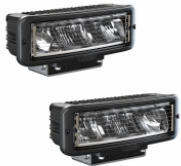
Part Number 0551863 24V ECE LED LHT Heated Headlight - 2 Light Kit