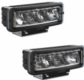
Part Number 0551863 24V ECE LED LHT Heated Headlight - 2 Light Kit