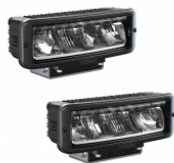
Part Number 0550171 12-24V ECE LED LHT Non-Heated Headlight - 2 Light Kit