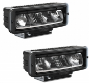
Part Number 0550061 12-24V DOT LED Non-Heated Headlight - 2 Light Kit