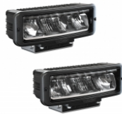
Part Number 0550161 12-24V ECE LED RHT Non-Heated Headlight - 2 Light Kit