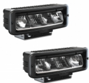
Part Number 0550061 12-24V DOT LED Non-Heated Headlight - 2 Light Kit