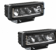
Part Number 0551803 24V DOT LED Heated Headlight - 2 Light Kit