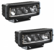
Part Number 0552243 12V DOT LED Heated Headlight - 2 Light Kit