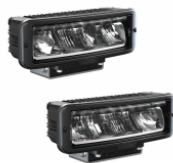
Part Number 0550161 12-24V ECE LED RHT Non-Heated Headlight - 2 Light Kit