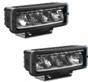
Part Number 0550171 12-24V ECE LED LHT Non-Heated Headlight - 2 Light Kit