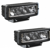
Part Number 0552423 12V ECE LED RHT Heated Headlight - 2 Light Kit