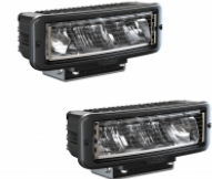
Part Number 0551863 24V ECE LED LHT Heated Headlight - 2 Light Kit