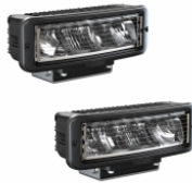
Part Number 0552423 12V ECE LED RHT Heated Headlight - 2 Light Kit