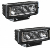
Part Number 0552433 12V ECE LED LHT Heated Headlight - 2 Light Kit