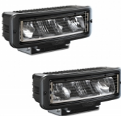
Part Number 0552243 12V DOT LED Heated Headlight - 2 Light Kit