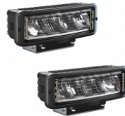
Part Number 0552433 12V ECE LED LHT Heated Headlight - 2 Light Kit