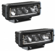
Part Number 0552243 12V DOT LED Heated Headlight - 2 Light Kit