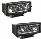
Part Number 0552423 12V ECE LED RHT Heated Headlight - 2 Light Kit