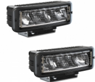
Part Number 0551863 24V ECE LED LHT Heated Headlight - 2 Light Kit