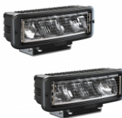
Part Number 0552433 12V ECE LED LHT Heated Headlight - 2 Light Kit