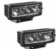
Part Number 0551863 24V ECE LED LHT Heated Headlight - 2 Light Kit