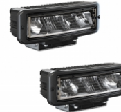
Part Number 0551803 24V DOT LED Heated Headlight - 2 Light Kit