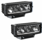
Part Number 0550161 12-24V ECE LED RHT Non-Heated Headlight - 2 Light Kit