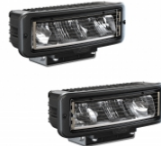
Part Number 0551803 24V DOT LED Heated Headlight - 2 Light Kit