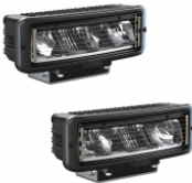
Part Number 0552243 12V DOT LED Heated Headlight - 2 Light Kit