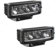
Part Number 0551863 24V ECE LED LHT Heated Headlight - 2 Light Kit