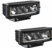
Part Number 0551803 24V DOT LED Heated Headlight - 2 Light Kit