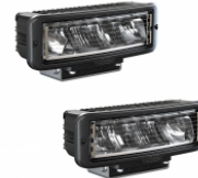
Part Number 0551833 24V ECE LED RHT Heated Headlight - 2 Light Kit