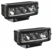
Part Number 0552243 12V DOT LED Heated Headlight - 2 Light Kit