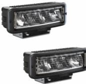
Part Number 0552423 12V ECE LED RHT Heated Headlight - 2 Light Kit