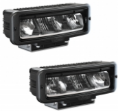
Part Number 0550061 12-24V DOT LED Non-Heated Headlight - 2 Light Kit