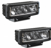
Part Number 0552433 12V ECE LED LHT Heated Headlight - 2 Light Kit