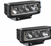
Part Number 0551833 24V ECE LED RHT Heated Headlight - 2 Light Kit