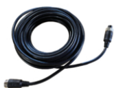
Part Number 3271561 4 PIN M12 CABLE, 10 m