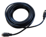
Part Number 3271581 4 PIN M12 CABLE, 6 m