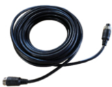
Part Number 3271561 4 PIN M12 CABLE, 10 m