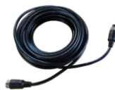
Part Number 3271581 4 PIN M12 CABLE, 6 m