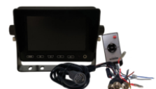
Part Number 6600801 COLOR MONITOR, 5", M12