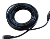
Part Number 3271581 4 PIN M12 CABLE, 6 m