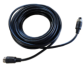
Part Number 3271561 4 PIN M12 CABLE, 10 m