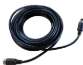
Part Number 3271581 4 PIN M12 CABLE, 6 m