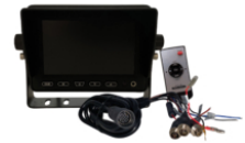
Part Number 6600801 COLOR MONITOR, 5", M12