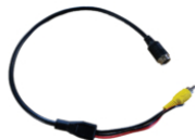
Part Number 3271571 RCA CONVERSION CABLE