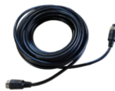
Part Number 3271581 4 PIN M12 CABLE, 6 m