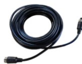
Part Number 3271581 M12 EXTENSION CABLE, 6 m