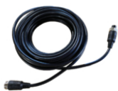
Part Number 3271561 4 PIN M12 CABLE, 10 m