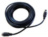
Part Number 3271561 4 PIN M12 CABLE, 10 m