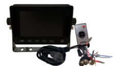
Part Number 6600801 COLOR MONITOR, 5", CS-JW5