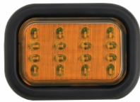
Part Number 0343921 12-24V ECE/SAE LED Turn Signal Light