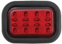
Part Number 0343911 12-24V ECE/SAE LED Stop & Tail Light