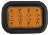
Part Number 0343921 12-24V ECE/SAE LED Turn Signal Light