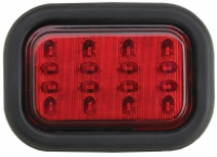
Part Number 0343911 12-24V ECE/SAE LED Stop & Tail Light