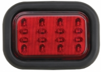
Part Number 0343911 12-24V ECE/SAE LED Stop & Tail Light