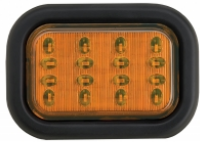
Part Number 0343921 12-24V ECE/SAE LED Turn Signal Light