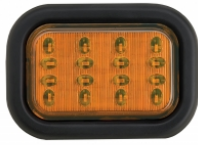
Part Number 0343921 12-24V ECE/SAE LED Turn Signal Light