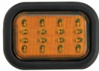
Part Number 0343921 12-24V ECE/SAE LED Turn Signal Light