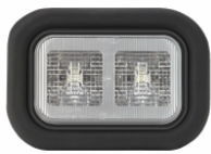
Part Number 0443081 12-24V ECE/SAE LED Backup Light