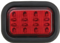
Part Number 0343911 12-24V ECE/SAE LED Stop & Tail Light