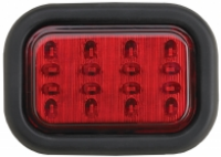
Part Number 0343911 12-24V ECE/SAE LED Stop & Tail Light