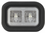
Part Number 0443081 12-24V ECE/SAE LED Backup Light