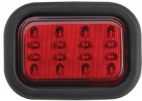
Part Number 0343911 12-24V ECE/SAE LED Stop & Tail Light