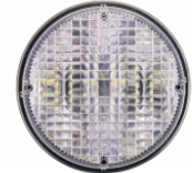
Part Number 0345461 12-24V ECE LED DRL & Front Position Light with 90mm Mounting Assembly Adapter