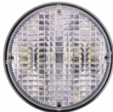
Part Number 0345461 12-24V ECE LED DRL & Front Position Light with 90mm Mounting Assembly Adapter