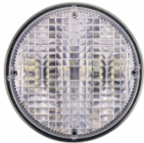
Part Number 0345461 12-24V ECE LED DRL & Front Position Light with 90mm Mounting Assembly Adapter