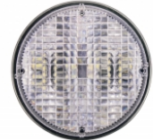
Part Number 0345461 12-24V ECE LED DRL & Front Position Light with 90mm Mounting Assembly Adapter