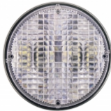
Part Number 0345461 12-24V ECE LED DRL & Front Position Light with 90mm Mounting Assembly Adapter