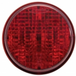
Part Number 0345411 12-24V ECE LED Stop & Tail Light without 90mm Mounting Assembly Adapter