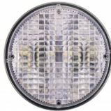
Part Number 0345511 12-24V ECE LED Rear Fog Light (Clear) without 90mm Mounting Assembly Adapter