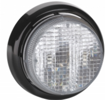
Part Number 0345451 12-24V ECE LED DRL & Front Position Light without 90mm Mounting Assembly Adapter