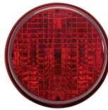
Part Number 0345431 12-24V ECE LED Rear Fog Light (Red) without 90mm Mounting Assembly Adapter