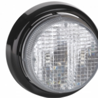
Part Number 0345451 12-24V ECE LED DRL & Front Position Light without 90mm Mounting Assembly Adapter