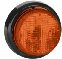
Part Number 0345521 12-24V SAE/ECE LED Turn Signal with 90mm Mounting Assembly Adapter