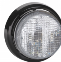
Part Number 0345451 12-24V ECE LED DRL & Front Position Light without 90mm Mounting Assembly Adapter