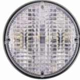
Part Number 0345421 12-24V SAE/ECE LED Backup Light without 90mm Mounting Assembly Adapter