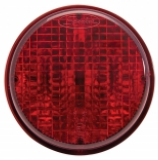
Part Number 0345411 12-24V ECE LED Stop & Tail Light without 90mm Mounting Assembly Adapter