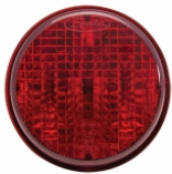
Part Number 0345411 12-24V ECE LED Stop & Tail Light without 90mm Mounting Assembly Adapter