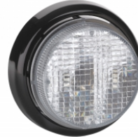
Part Number 0345451 12-24V SAE/ECE LED DRL & Front Position Light with 90mm Mounting Assembly Adapter