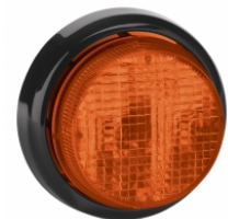
Part Number 0345521 12-24V ECE LED Turn Signal with 90mm Mounting Assembly Adapter