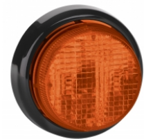
Part Number 0345521 12-24V ECE LED Turn Signal with 90mm Mounting Assembly Adapter