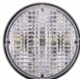
Part Number 0345421 12-24V ECE LED Backup Light without 90mm Mounting Assembly Adapter