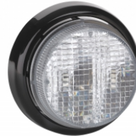
Part Number 0345451 12-24V SAE/ECE LED DRL & Front Position Light without 90mm Mounting Assembly Adapter