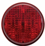
Part Number 0345411 12-24V ECE LED Stop & Tail Light without 90mm Mounting Assembly Adapter