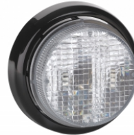
Part Number 0345451 12-24V SAE/ECE LED DRL & Front Position Light with 90mm Mounting Assembly Adapter