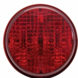
Part Number 0345411 12-24V ECE LED Stop & Tail Light without 90mm Mounting Assembly Adapter