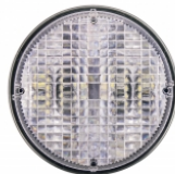
Part Number 0345421 12-24V ECE LED Backup Light without 90mm Mounting Assembly Adapter