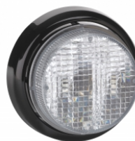
Part Number 0345451 12-24V ECE LED DRL & Front Position Light without 90mm Mounting Assembly Adapter