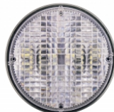
Part Number 0345421 12-24V ECE LED Backup Light without 90mm Mounting Assembly Adapter