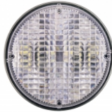
Part Number 0345421 12-24V SAE/ECE LED Backup Light without 90mm Mounting Assembly Adapter