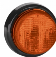
Part Number 0345521 12-24V ECE LED Turn Signal with 90mm Mounting Assembly Adapter