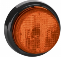
Part Number 0345521 12-24V SAE/ECE LED Turn Signal with 90mm Mounting Assembly Adapter