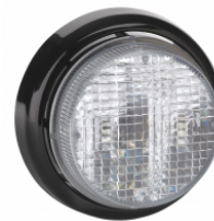
Part Number 0345451 12-24V ECE LED DRL & Front Position Light without 90mm Mounting Assembly Adapter