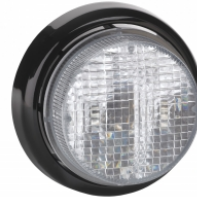
Part Number 0345451 12-24V SAE/ECE LED DRL & Front Position Light with 90mm Mounting Assembly Adapter