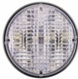
Part Number 0345421 12-24V SAE/ECE LED Backup Light without 90mm Mounting Assembly Adapter