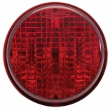
Part Number 0345411 12-24V ECE LED Stop & Tail Light without 90mm Mounting Assembly Adapter