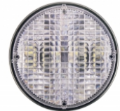
Part Number 0345461 12-24V ECE LED DRL & Front Position Light with 90mm Mounting Assembly Adapter