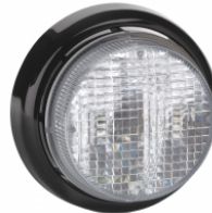
Part Number 0345451 12-24V ECE LED DRL & Front Position Light without 90mm Mounting Assembly Adapter