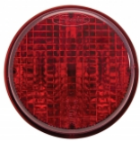
Part Number 0345411 12-24V ECE LED Stop & Tail Light without 90mm Mounting Assembly Adapter