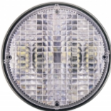
Part Number 0345511 12-24V ECE LED Rear Fog Light (Clear) without 90mm Mounting Assembly Adapter