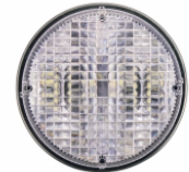
Part Number 0345461 12-24V ECE LED DRL & Front Position Light with 90mm Mounting Assembly Adapter