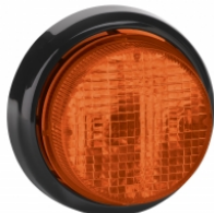
Part Number 0345521 12-24V ECE LED Turn Signal with 90mm Mounting Assembly Adapter