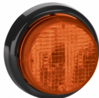
Part Number 0345521 12-24V ECE LED Turn Signal with 90mm Mounting Assembly Adapter