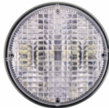
Part Number 0345421 12-24V ECE LED Backup Light without 90mm Mounting Assembly Adapter