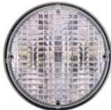
Part Number 0345511 12-24V ECE LED Rear Fog Light (Clear) without 90mm Mounting Assembly Adapter