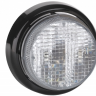
Part Number 0345451 12-24V ECE LED DRL & Front Position Light without 90mm Mounting Assembly Adapter