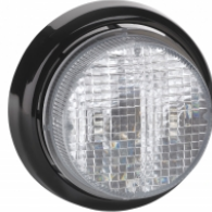
Part Number 0345451 12-24V SAE/ECE LED DRL & Front Position Light without 90mm Mounting Assembly Adapter