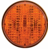
Part Number 0345441 12-24V SAE/ECE LED Turn Signal without 90mm Mounting Assembly Adapter