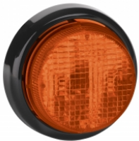
Part Number 0345521 12-24V ECE LED Turn Signal with 90mm Mounting Assembly Adapter