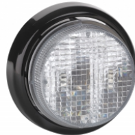
Part Number 0345451 12-24V ECE LED DRL & Front Position Light without 90mm Mounting Assembly Adapter