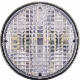
Part Number 0345511 12-24V ECE LED Rear Fog Light (Clear) without 90mm Mounting Assembly Adapter