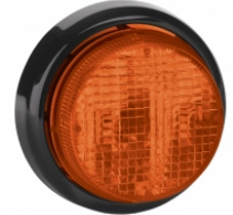
Part Number 0345521 12-24V SAE/ECE LED Turn Signal with 90mm Mounting Assembly Adapter