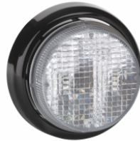
Part Number 0345451 12-24V ECE LED DRL & Front Position Light without 90mm Mounting Assembly Adapter