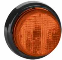
Part Number 0345521 12-24V ECE LED Turn Signal with 90mm Mounting Assembly Adapter