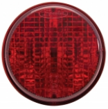
Part Number 0345411 12-24V ECE LED Stop & Tail Light without 90mm Mounting Assembly Adapter