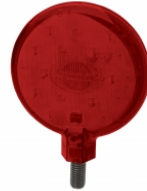
Part Number 0342771 12-24V ECE/SAE Single-Sided LED Stop & Tail Light without Guard