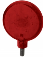
Part Number 0342771 12-24V ECE/SAE Single-Sided LED Stop & Tail Light without Guard