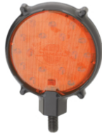
Part Number 0341931 12-24V SAE Double-Sided LED Turn Signal with Guard