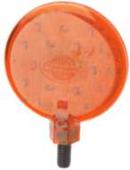
Part Number 0341681 12-24V SAE Double-Sided LED Turn Signal without Guard