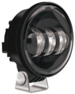
Part Number 0552961 12-110V LED Red Zone Light