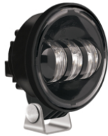
Part Number 0552971 12-110V LED Blue Zone Light