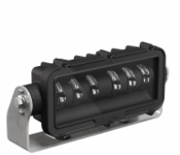
Part Number 0551261 12-24V LED White Zone Light