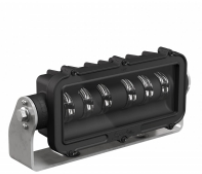
Part Number 0551271 12-24V LED Green Zone Light