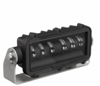
Part Number 0549271 12-24V LED Red Zone Light