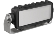
Part Number 0647021 12-24V LED Amber & Green Signal Light