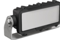
Part Number 0647021 12-24V LED Amber & Green Signal Light