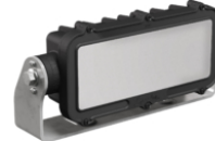
Part Number 0647011 12-24V LED Red & Green Signal Light