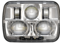
Part Number 0554461 12-24V DOT/ECE LED RHT High & Low Beam Heated Headlight with Chrome Inner Bezel