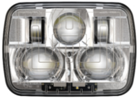
Part Number 0554421 12-24V ECE LED LHT High & Low Beam Heated Headlight with Chrome Inner Bezel