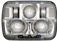
Part Number 0554461 12-24V DOT/ECE LED RHT High & Low Beam Heated Headlight with Chrome Inner Bezel