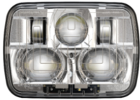
Part Number 0554461 12-24V DOT/ECE LED RHT High & Low Beam Heated Headlight with Chrome Inner Bezel