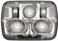
Part Number 0554421 12-24V ECE LED LHT High & Low Beam Heated Headlight with Chrome Inner Bezel