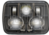
Part Number 0554481 12-24V DOT/ECE LED RHT High & Low Beam Heated Headlight with Black Inner Bezel