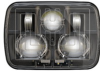
Part Number 0554481 12-24V DOT/ECE LED RHT High & Low Beam Heated Headlight with Black Inner Bezel