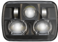
Part Number 0554451 12-24V ECE LED LHT High & Low Beam Headlight with Black Inner Bezel - Single Light