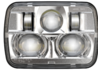
Part Number 0554471 12-24V DOT/ECE LED RHT High & Low Beam Headlight with Chrome Inner Bezel - Single Light