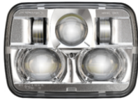
Part Number 0554471 12-24V DOT/ECE LED RHT High & Low Beam Headlight with Chrome Inner Bezel - Single Light