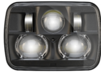
Part Number 0554491 12-24V DOT/ECE LED RHT High & Low Beam Headlight with Black Inner Bezel - Single Light