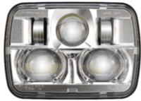
Part Number 0554431 12-24V ECE LED LHT High & Low Beam Headlight with Chrome Inner Bezel - Single Light