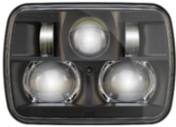
Part Number 0554451 12-24V ECE LED LHT High & Low Beam Headlight with Black Inner Bezel - Single Light