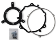
Part Number 8200791 Thomas Built Bus 7 inch Headlight Mounting Kit