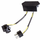
Part Number 8000381 H4/H4 Anti-Flicker Harness for J.W. Speaker LED headlights