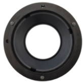
Part Number 8201111 Black Polycarbonate Bucket for 7" Round (PAR56) Headlight