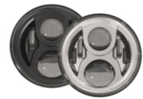
Part Number 0554941 12-24V DOT LED High & Low Beam Headlight with Black Inner Bezel