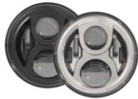
Part Number 0554991 12-24V DOT LED High & Low Beam Headlight with Chrome Inner Bezel with Mounting Ring