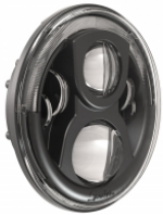
Part Number 0552751 12-24V ECE LED LHT High & Low Beam Headlight with FP, DRL, & Black Inner Bezel