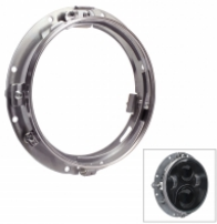
Part Number 3156351 Mounting Ring Kit for 7" Round (PAR56) Headlights