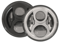
Part Number 0554981 12-24V DOT LED High & Low Beam Headlight with Black Inner Bezel with Mounting Ring