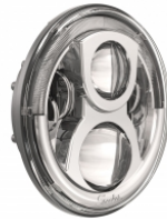
Part Number 0553311 12-24V ECE LED LHT High & Low Beam Headlight with FP, DRL, Chrome Inner Bezel