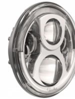
Part Number 0553321 12-24V ECE LED RHT High & Low Beam Headlight with FP, DRL, Chrome Inner Bezel