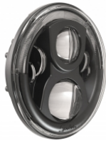
Part Number 0552761 12-24V ECE LED RHT High & Low Beam Headlight with FP, DRL, Black Inner Bezel