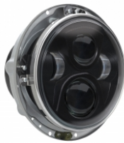
Part Number 3156561 Panel Mount Bucket Assembly for 8700 Evolution & 8710 Series