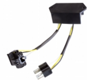
Part Number 8000381 Anti-Flicker Harness H4/H4 for 8700 Evolution Series Headlights