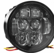
Part Number 0549891 12-24V ECE LED LHT High & Low Beam Headlight