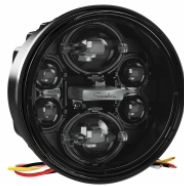
Part Number 0549871 12-24V DOT/ECE LED High Beam Headlight