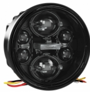
Part Number 0549871 12-24V DOT/ECE LED High Beam Headlight