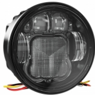
Part Number 0549861 12-24V ECE LED LHT Low Beam Headlight