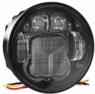
Part Number 0549851 12-24V DOT/ECE LED RHT Low Beam Headlight