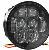
Part Number 0549891 12-24V ECE LED LHT High & Low Beam Headlight