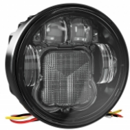
Part Number 0549851 12-24V DOT/ECE LED RHT Low Beam Headlight