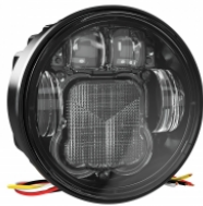
Part Number 0549861 12-24V ECE LED LHT Low Beam Headlight