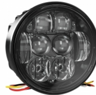
Part Number 0549891 12-24V ECE LED LHT High & Low Beam Headlight