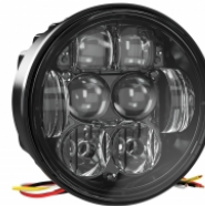
Part Number 0549891 12-24V ECE LED LHT High & Low Beam Headlight