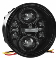
Part Number 0549871 12-24V DOT/ECE LED High Beam Headlight