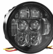
Part Number 0549891 12-24V ECE LED LHT High & Low Beam Headlight