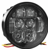
Part Number 0549881 12-24V DOT/ECE LED RHT High & Low Beam Headlight