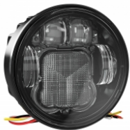
Part Number 0549861 12-24V ECE LED LHT Low Beam Headlight