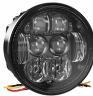
Part Number 0549881 12-24V DOT/ECE LED RHT High & Low Beam Headlight