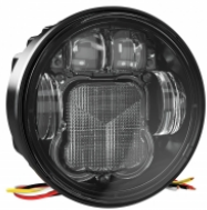
Part Number 0549861 12-24V ECE LED LHT Low Beam Headlight