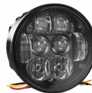
Part Number 0549891 12-24V ECE LED LHT High & Low Beam Headlight