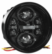
Part Number 0549871 12-24V DOT/ECE LED High Beam Headlight