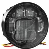
Part Number 0549861 12-24V ECE LED LHT Low Beam Headlight