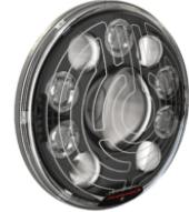
Part Number 0561031 24-110V LED Locomotive Headlight with Warm White Spot Beam Pattern & Heated Lens