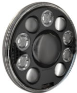
Part Number 0561051 24-110V LED Locomotive Headlight with Warm White leds with no EOL. AU & ROW use