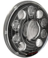
Part Number 0556571 24-110V LED Locomotive Headlight with Cool White leds & Heated Lens. AU & ROW use.