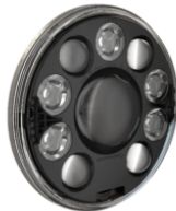
Part Number 0561051 24-110V LED Locomotive Headlight with Warm White leds with no EOL. AU & ROW use