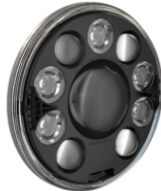
Part Number 0561051 24-110V LED Locomotive Headlight with Warm White leds with no EOL. AU & ROW use