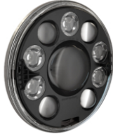
Part Number 0555711 24-110V LED Locomotive Headlight with Cool White leds. AU & ROW use