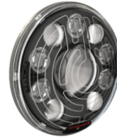
Part Number 0561031 24-110V LED Locomotive Headlight with Warm White Spot Beam Pattern & Heated Lens