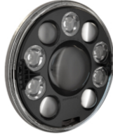
Part Number 0554601 24-110V LED Locomotive Headlight with Spot Beam Pattern