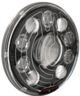
Part Number 0561041 24-110V LED Locomotive Headlight with Warm White leds and Heated Lens with no EOL. AU & ROW use