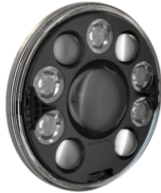
Part Number 0555711 24-110V LED Locomotive Headlight with Cool White leds. AU & ROW use