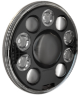
Part Number 0554601 24-110V LED Locomotive Headlight with Spot Beam Pattern