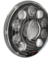
Part Number 0556571 24-110V LED Locomotive Headlight with Cool White leds & Heated Lens. AU & ROW use.