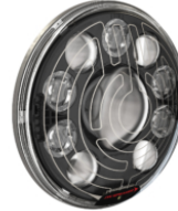
Part Number 0556571 24-110V LED Locomotive Headlight with Cool White leds & Heated Lens. AU & ROW use.