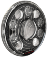
Part Number 0551901 24-110V LED Locomotive Headlight with Spot Beam Pattern & Heated Lens