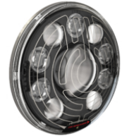
Part Number 0561031 24-110V LED Locomotive Headlight with Warm White Spot Beam Pattern & Heated Lens