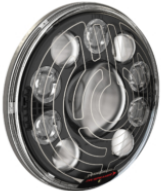
Part Number 0561041 24-110V LED Locomotive Headlight with Warm White leds and Heated Lens with no EOL. AU & ROW use