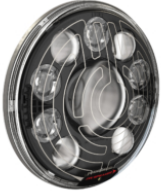
Part Number 0551901 24-110V LED Locomotive Headlight with Spot Beam Pattern & Heated Lens